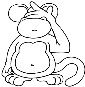
close your eyes