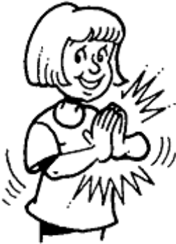
clap your hands