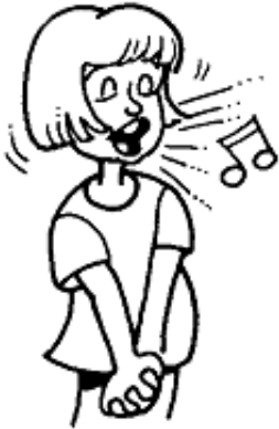
sing a song