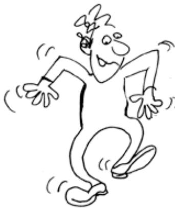
stomp your feet